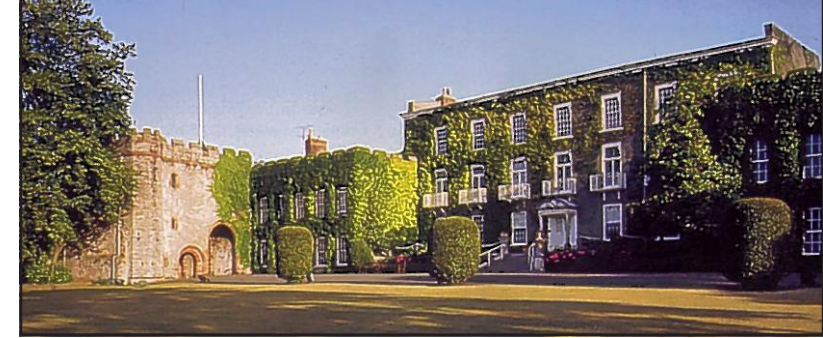
VENUES: Torre Abbey, above, the Princess Theatre, below, and Palace

easier for people to access all sorts of things'